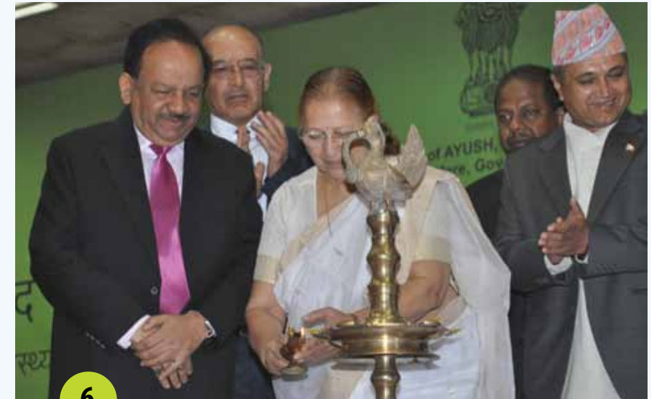
6 th World Ayurveda Congress & Arogya Expo 2014, Delhi Theme: 'Health Challenges and Ayurveda'