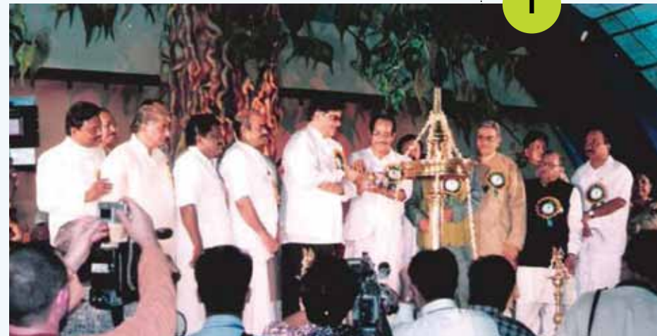
1 st Ayurveda Congress, 2002 - Kochi Theme: 'Ayurveda & World Health'