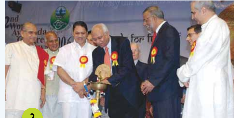
2 nd World Ayurveda Congress & Arogya Expo, 2006 - Pune Theme: 'Globalisation of Ayurveda'