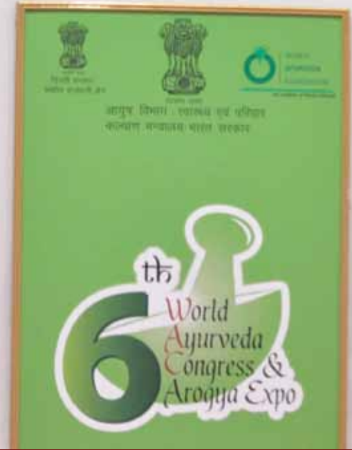
Shri Narendra Modi Hon'ble Prime Minister of India delivering the valedictory address of the 6th World Ayurveda Congress & Arogya Expo 2014, Delhi