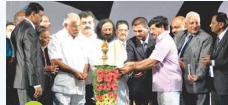
4 th Ayurveda Congress & Arogya Expo, 2010 - Bengaluru Theme: 'Ayurveda for all'