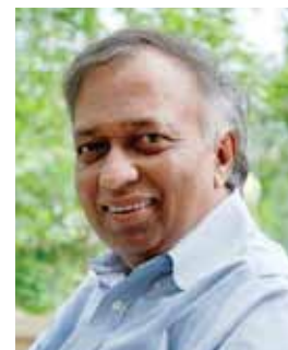
Dr. Vijay P Bhatkar President Vijnana Bharati

Every two years, the admirers, practioners, entrepreneurs, teachers and students of Ayurveda assemble around the month of December to participate in the World Ayurveda Congress (WAC) in the country. The representation is not just from different parts of India, but also from all over the world. The atmosphere has always been that of a festival 'Celebrating Ayurveda'.