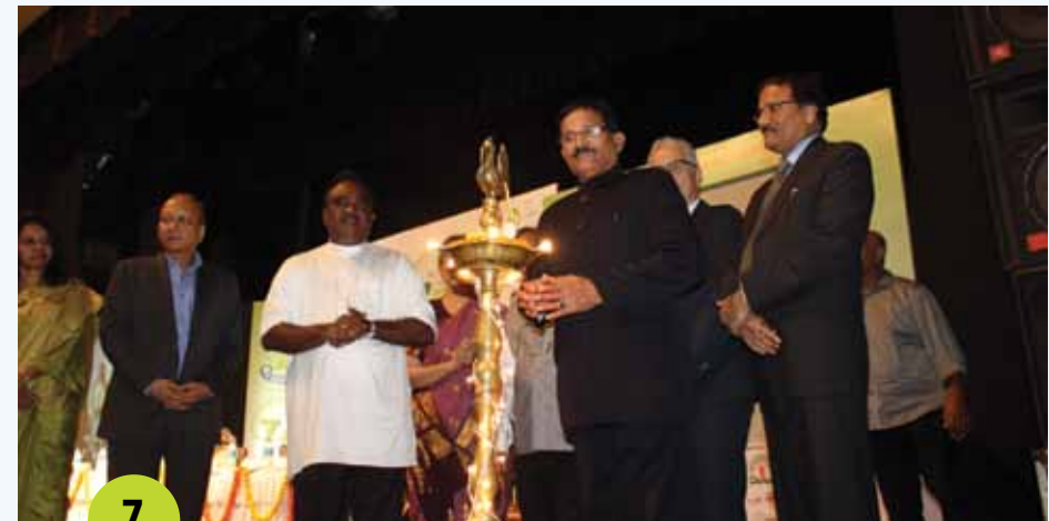
7 th Ayurveda Congress, 2016- Kolkata Theme: Strengthening the Ayurveda Eco Systems