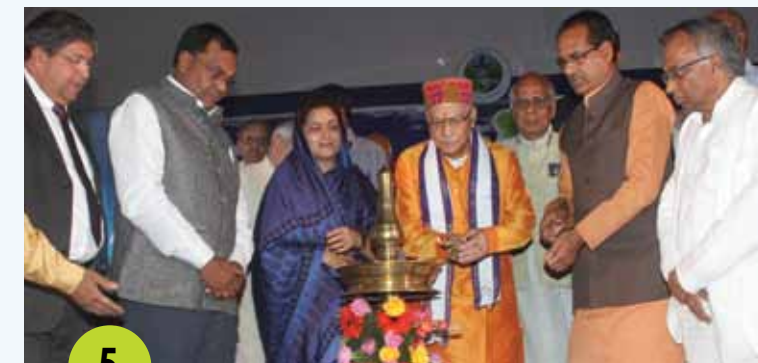
5 th Ayurveda Congress, 2012 - Bhopal Theme: 'Enriching Public Health Through Ayurveda'