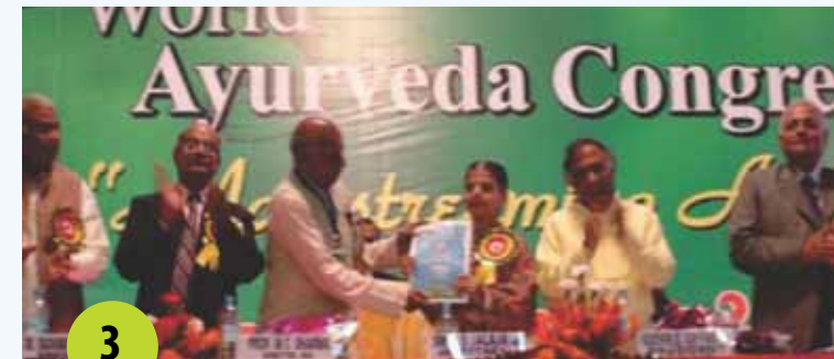
3 rd Ayurveda Congress & Arogya Expo, 2008 - Jaipur Theme: 'Mainstreaming Ayurveda'