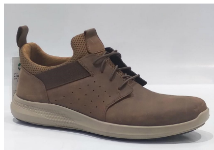
MODEL: KINLEY 05