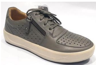
MODEL: DENIZE 03