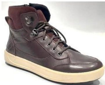
MODEL: DENIZE 13