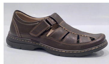
MODEL: BONDY 02