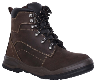
MODEL: BEN 36